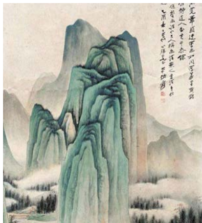
Figure 2 Digital comics case